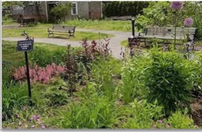
Anne Wallau Garden