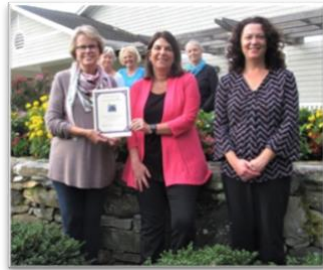
The Beechwood Community Center has been recognized for the beautiful raised flower beds across the front of their building.